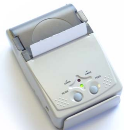
Combined Printer and Card Reader