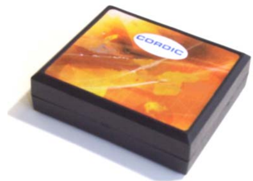
Voice Recording Unit