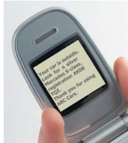
Send text message to passenger when car arrives with vehicle details

Try a Live Demo of Text Booking at www.cordic.com