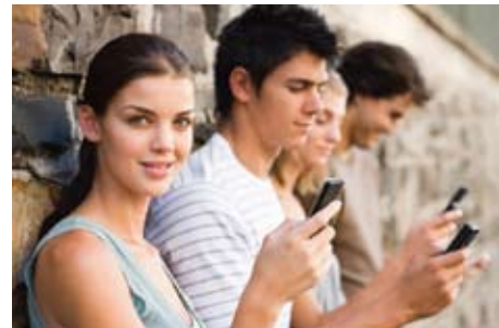
Book your vehicle