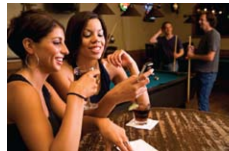
Receive booking confirmation