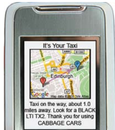
Passenger can track the progress of their vehicle in real-time on a map