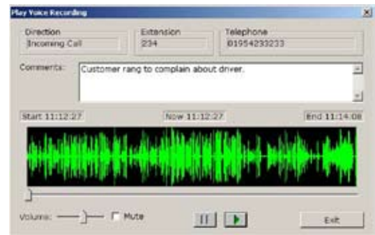
Playback with option to fast forward

Cordic's Voice Recording system discreetly records incoming and outgoing calls without intrusion. It ensures that all details of the calls are kept on file for future reference.