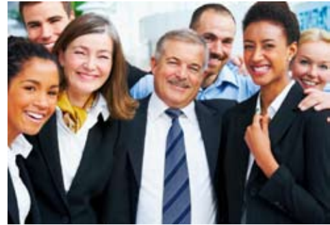
Keep your customers happy