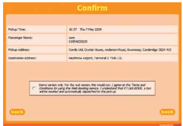
User receives instant confirmation